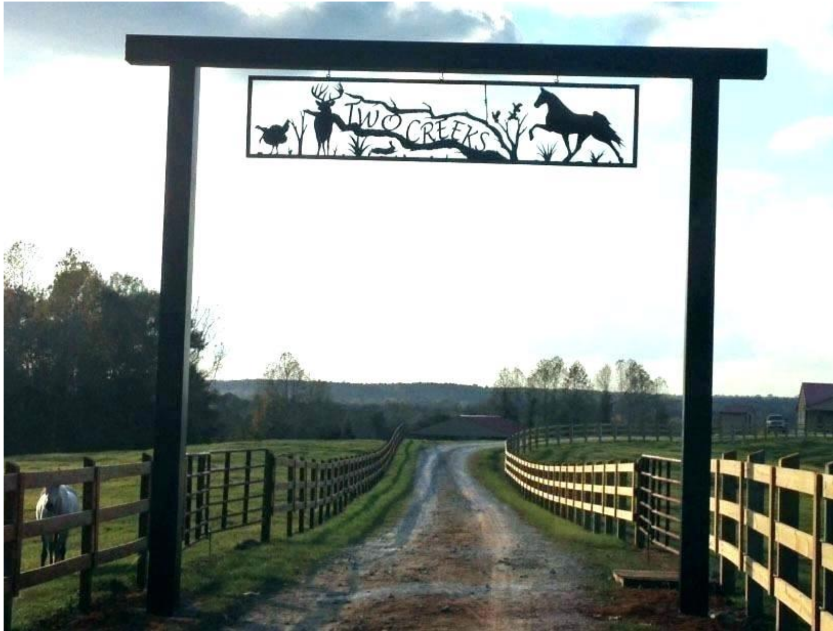
Sign across Road welcoming people