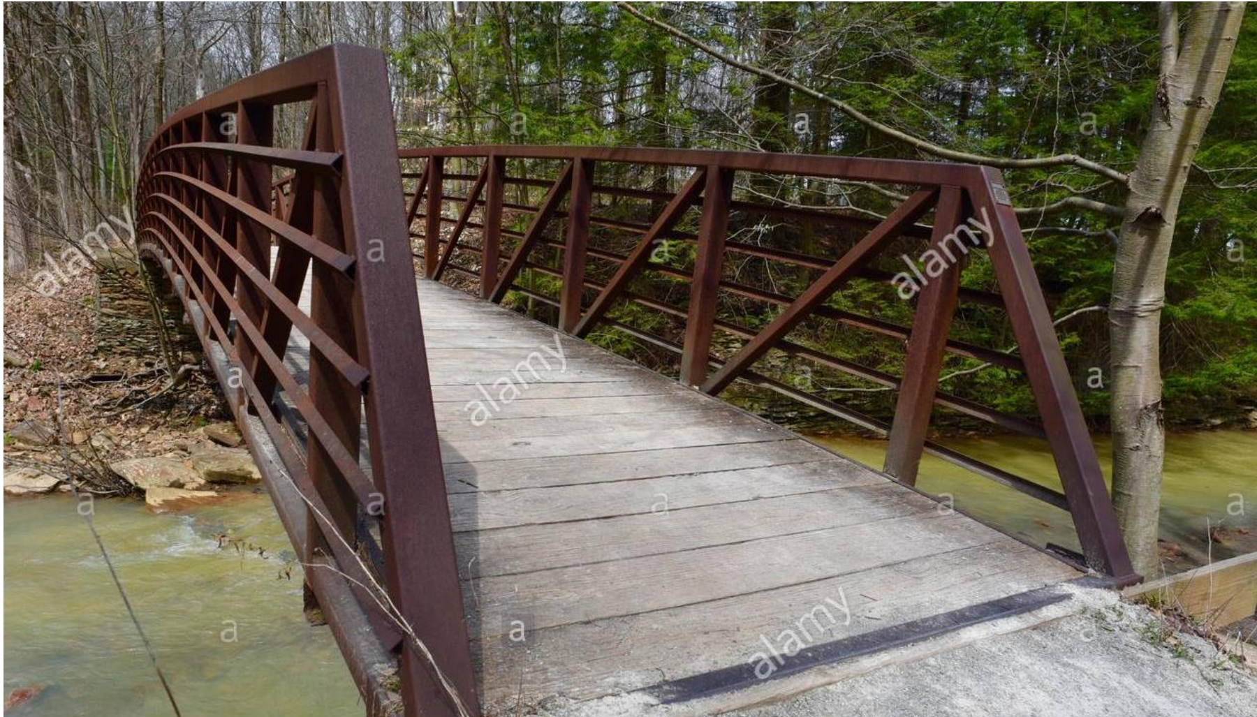
A bridge across Back Creek