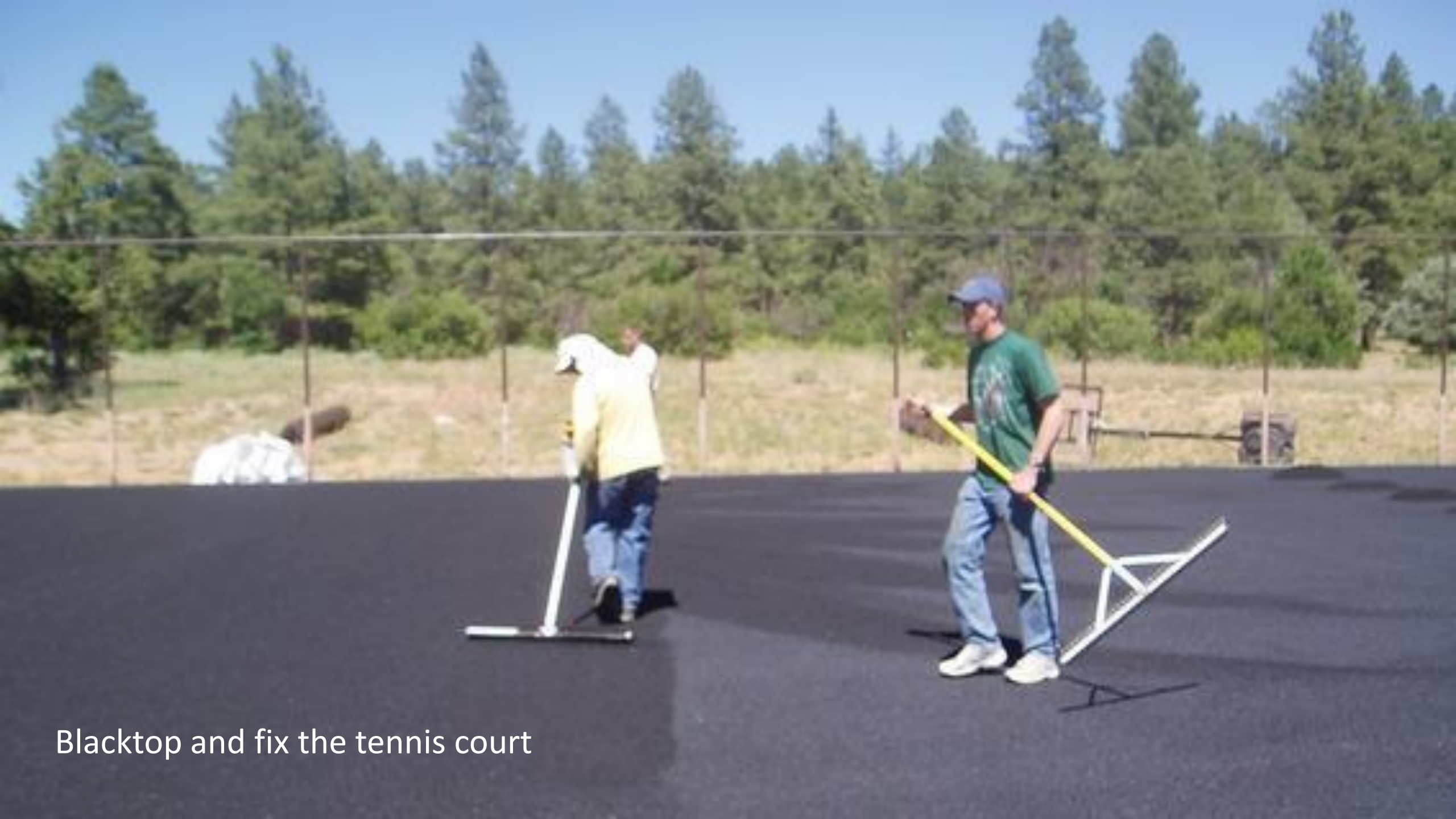
Blacktop and fix the tennis court